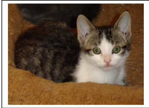
Dolly is a sweet, playful 6-month old female white tabby.