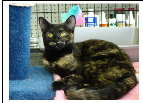
Tika is a loving, cuddly 10-month old female Siamese-cross tortoise-shell.